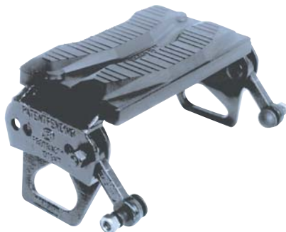
PROTRAC™ Heavy-Duty Rubber Shoe