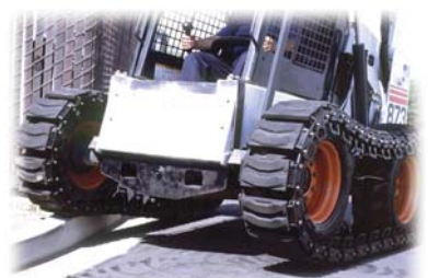
PROTRAC™ Rubber Track Protects Delicate Surfaces

Another factor to consider is - how well will it fit? PROTRAC™ has been engineered to be the best fitting track on the market. It will fit your existing skid steer tires to perfection, with no slipping or damage to the tire. The durable steel base comes in two different sizes to fit 10-inch and 12-inch wide tires. Fourteen inch is available for Diamond only.