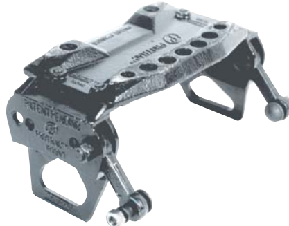
PROTRAC™ Magnum Shoe