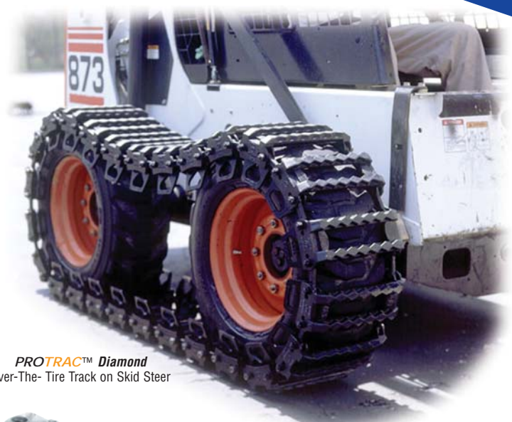
PROTRAC™ Diamond Over-The-Tire Track on Skid Steer

The PROTRAC™ Diamond over-the-tire skid steer track system is the solution for those in need of a general purpose or regular duty track. The diamond pattern bites into mud, clay, loose rock, sand and even snow and ice like no other type of track. The PROTRAC™ Diamond has equal or greater traction going forward or backward but the unique diamond configuration reduces sideslip, greatly improving productivity and safety on side slopes. The PROTRAC™ Diamond track is made from manganese steel alloy, not just cast iron or steel. This track also incorporates a link and pin system (which forms the chain) made from Chromium. These two materials ensure a light-weight track that is much stronger and longer lasting than any other track system in the same class.