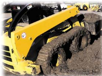
PROTRAC™ Magnum Track Works Great in Its Native Element-Mud